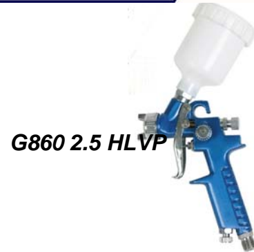
G860 2.5 HLVP

ES Manufacturing, Inc. PO Box 11692 St. Petersburg, FL 33733-1692 USA